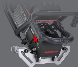
Stainless steel guide plate assembly Code: B60.1020S