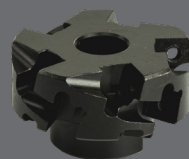
Milling head Code: B60.0027